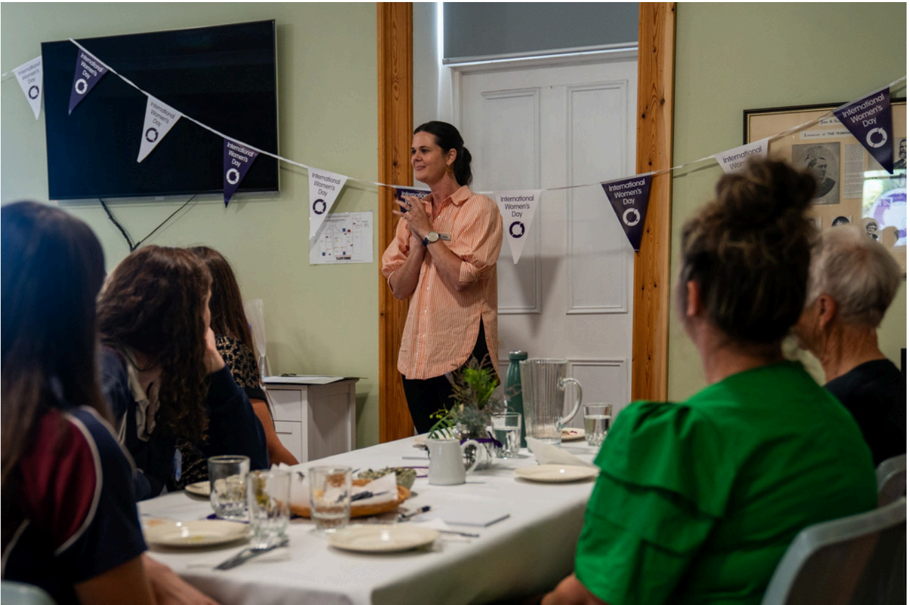
Fingal Valley Neighbourhood House: International Women's Day