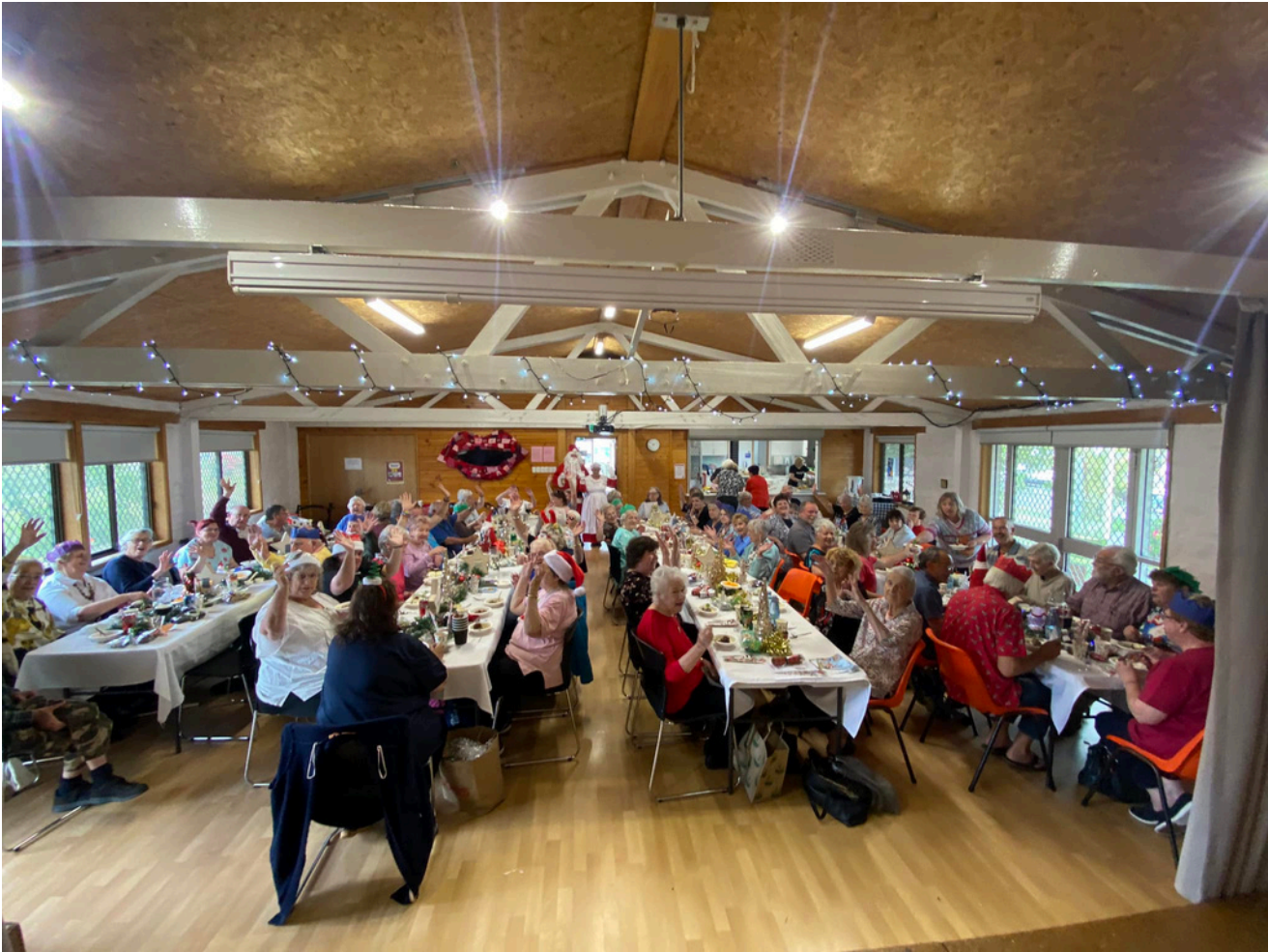
Goodwood Community Centre: Christmas Lunch