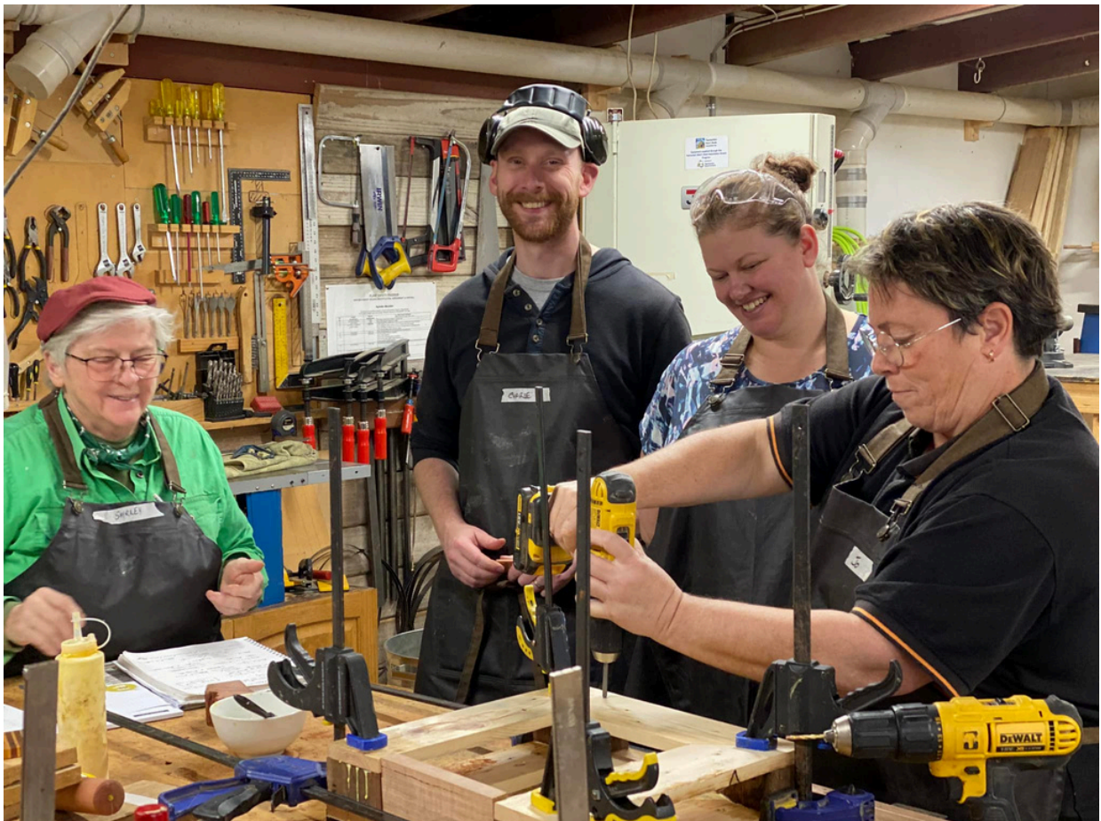
Geeveston Community Centre: Community Workshop