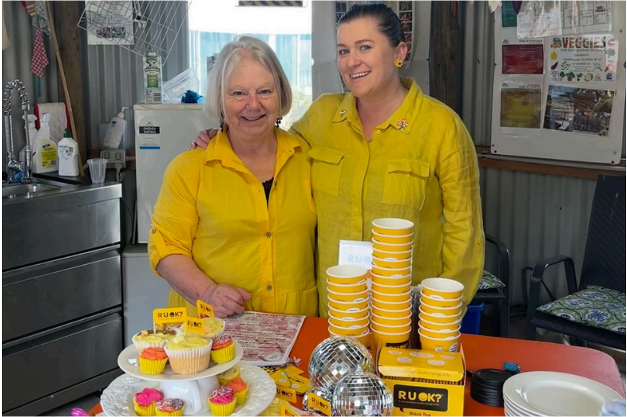
Phoenix Community House: R U OK Day Celebrations