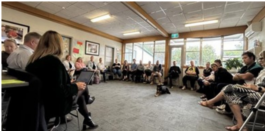
Manager Meeting at the NHT Office in Derwent Park (featuring Macie the dog!)

NHT conducted a preferred provider process to address insurance concerns, particularly on child protection coverage. Out of 23 firms contacted, Steadfast Statewide Insurance were successful. We look forward to continuing to work with Steadfast to achieve better value for coverage for our members.